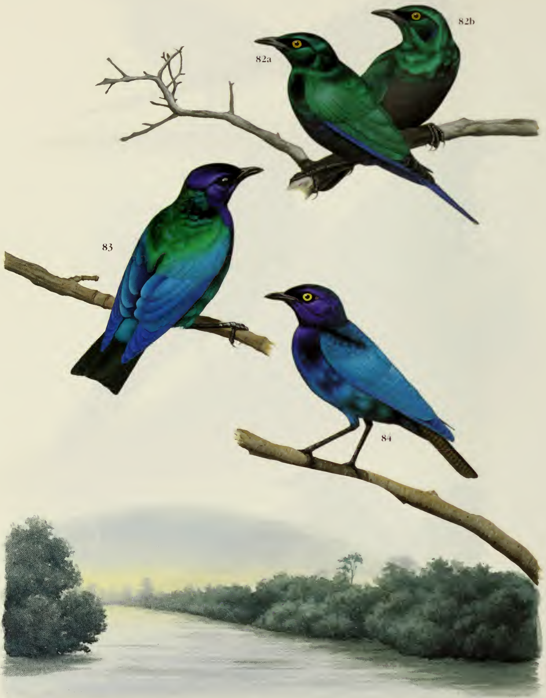
Plate 5. 82: Black-bellied Glossy Starling Lamprotornis corruscus ( a = adult male, b = adult female). 83: Purple-headed Glossy Starling Hypopsar purpureiceps . 84: Coppery-tailed Glossy Starling Hypopsar cupreocauda .